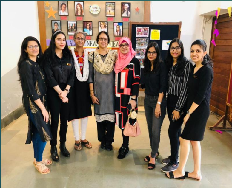
Student Council- 2021-2022