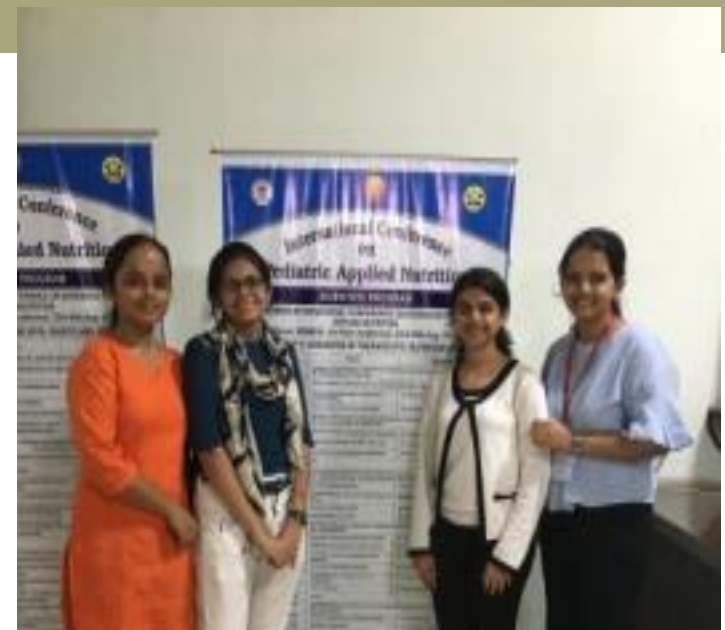
Students attended the International Conference on Pediatric Applied Nutrition in D.Y. Patil University on 24 th August, 2019