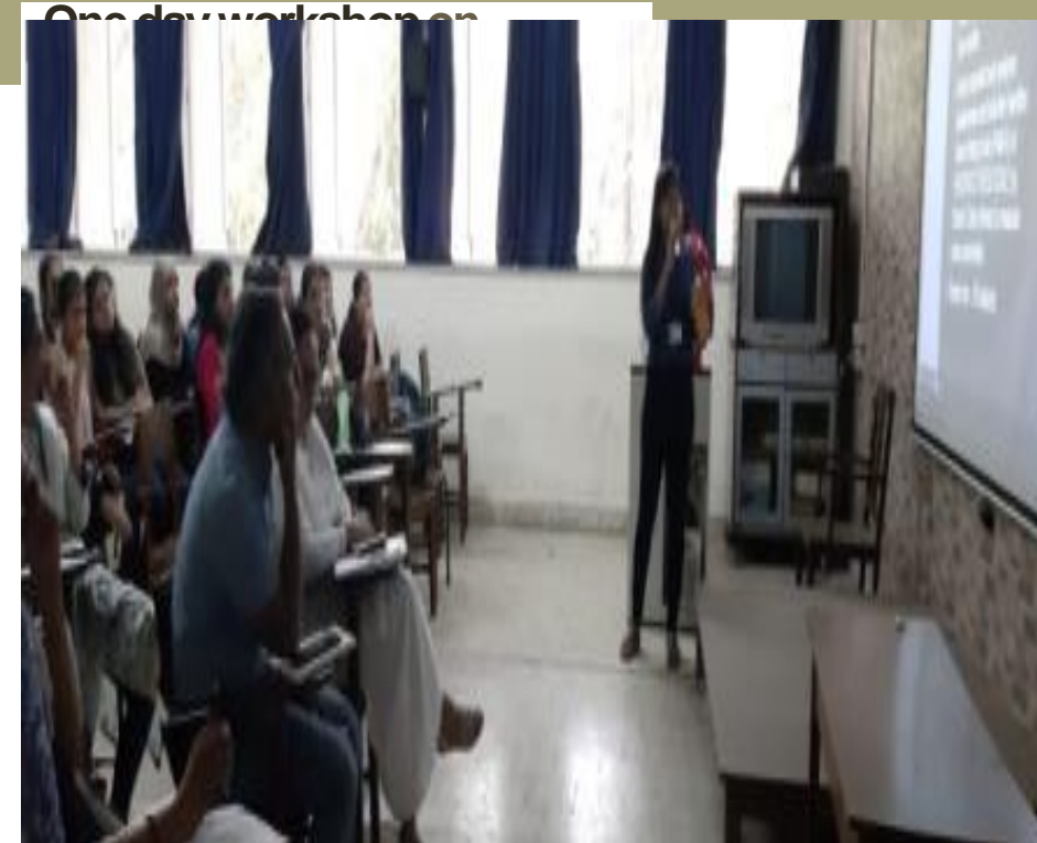
Staff and Students attended the IAPEN-CNE on August 17 th 2019 at Kokilaben Hospital