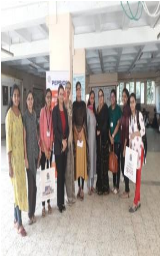
Orientation for SNF Program for Whole grains Project-30 th August 2019